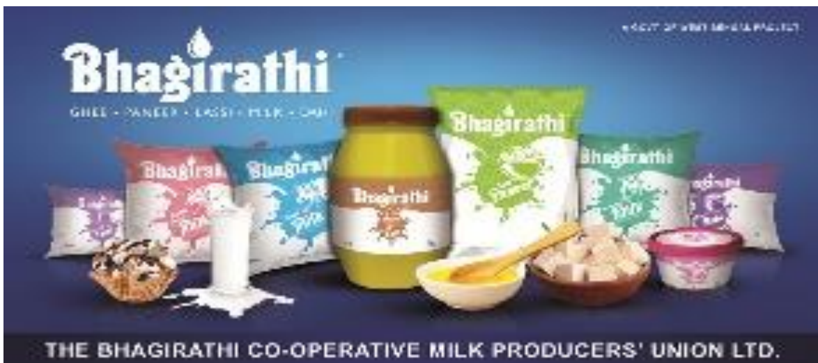
Range of Products of Bhagirathi Milk Union

The Bhagirathi Cooperative Milk Producers' Union Ltd., was established in the year 1974, under the "Operation Flood Programme" as a Cooperative Society and is registered under West Bengal Cooperative Societies Act and Rules. The main objective of Bhagirathi Milk Union is bringing about socio-economic transformation of the rural masses through organizing Dairy Cooperative Societies in the district of Murshidabad. Over a period of 44 years, the Bhagirathi Milk Union has been able to infuse a new life in the cooperative movement of the West Bengal, ensuring democratic functioning of the cooperatives such as members' involvement in decision making process, to promote thrift, self-help and mutual aid, involving womenfolk and also to provide for transparent, devoted and efficient management and services relevant to the needs of the cooperatives. The operational area of the Union is entire Murshidabad district which covers 26 blocks.