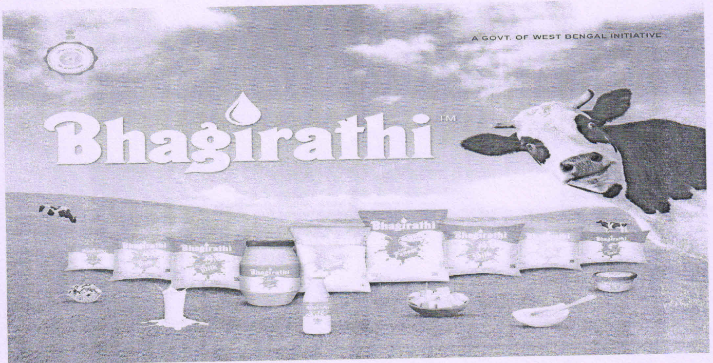
Range of Products of Bhagirathi Milk Union

The Bhagirathi Cooperative Milk Producers' Union Ltd., was established in the year 1974, under the "Operation Flood Programme" as a Cooperative Society and is registered under West Bengal Cooperative Societies Act and Rules. The main objective of Bhagirathi Milk Union is bringing about socio-economic transformation of the rural masses through organizing Dairy Cooperative Societies in the district of Murshidabad. Over a period of 44 years, the Bhagirathi Milk Union has been able to infuse a new life in the cooperative movement of the West Bengal, ensuring democratic functioning of the cooperatives such as members' involvement in decision making process, to promote thrift, self-help and mutual aid, involving womenfolk and also to provide for transparent, devoted and efficient management and services relevant to the needs of the cooperatives. The operational area of the Union is entire Murshidabad district which covers 26 blocks.